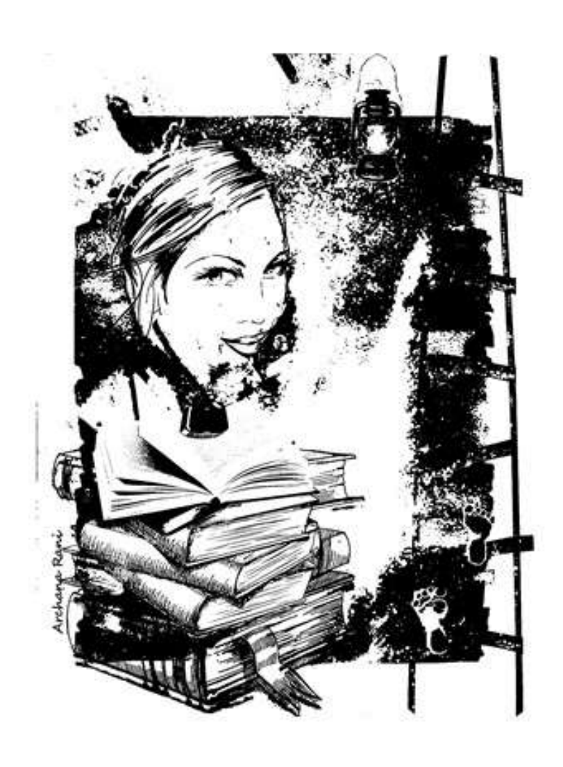
"Ultimately, education in its real sense is the pursuit of truth. It is an endless journey through knowledge and enlightenment."