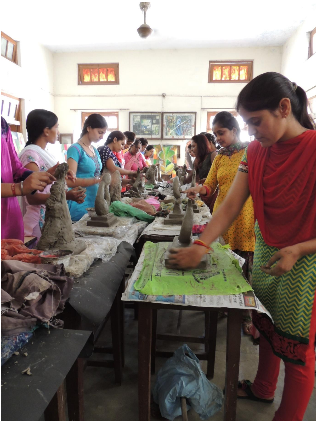
Meer Principal Raghunath Girls' Post Graduate College Meerut