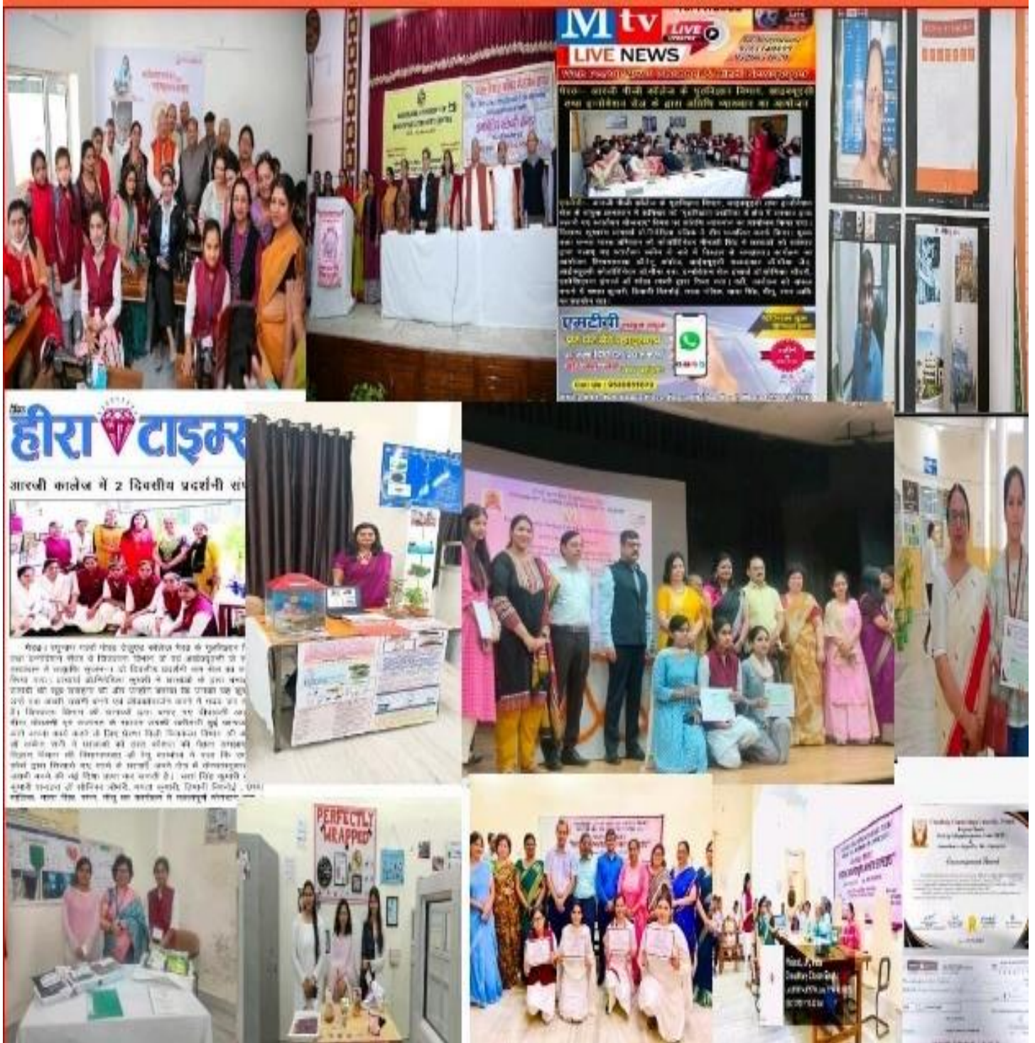
Glimpses of activities done in 2022-23