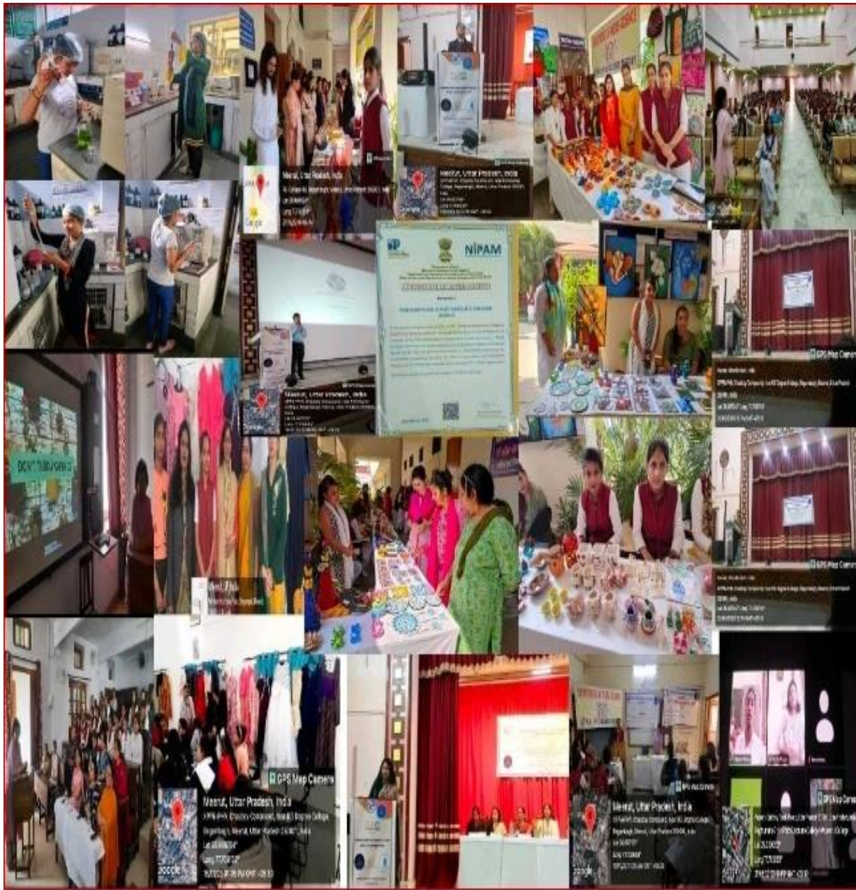
Glimpses of activities done in 2022-23